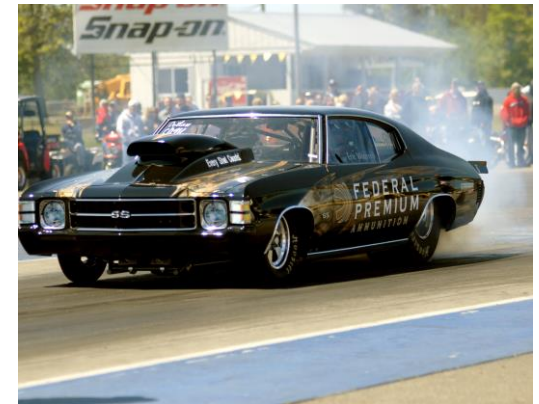
2000 HP Motor 191 MPH in 7 Seconds (1/4 Mile)