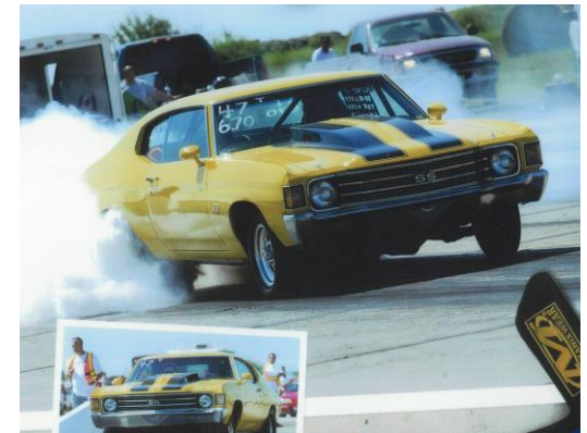
1000 HP Motor 150 MPH in 9 Seconds (1/4 Mile)

The SuperTrac's Museum now includes two 1971 Chevelle Cars.